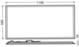
LDVAL PL0612B TRI